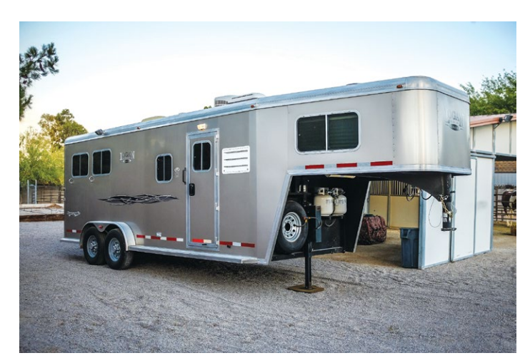
Train your horses to load into a horse trailer and make sure there is enough trailer space for all of the horses on the property.

The best method for preventing injury to horses during a wildfire is to evacuate early. The other option is to shelter in place, which includes the possibility of having to decide whether to turn horses loose if the fire changes speed or course and evacuation is no longer an option. Turning horses loose comes with a new set of risks to consider.