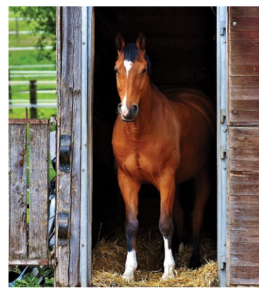
Loose horses may try to return to familiar places, such as barns, even if flames are present.

6 Loose horses may try to come back to barns, corrals, etc., even if structures are on fire. Horses will naturally return to familiar places. If you must let horses loose during a wildfire, close barn doors, gates, etc. after setting them loose to keep them from potentially reentering dangerous areas.