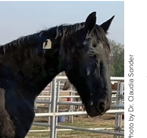
Ear tags placed in the mane can provide temporary identification.

Once horses are out of your control, safety issues may arise for both horses and people in the area. Horses could enter major roadways with traffic and be hit by evacuating or responding vehicles, potentially injuring the horse(s) and people in the vehicle. Horses could suffer trauma from falling while running on slippery roads, kicking other loose horses, running through